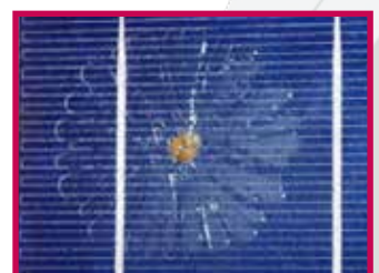
Laminated lady bug