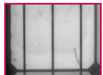
Micro crack between bus bars