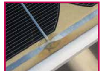
Yellowing and corroding panel