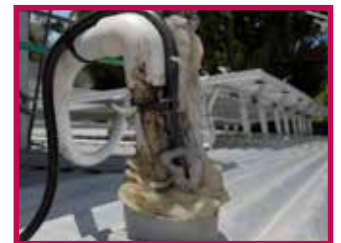
Poor installation quality

*From solar panel installation audit report, NSW Department of Fair Trading, pg 1